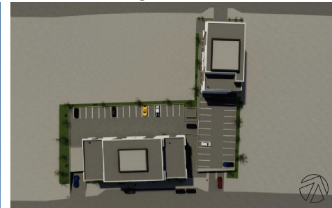
JUNE AT 3PM