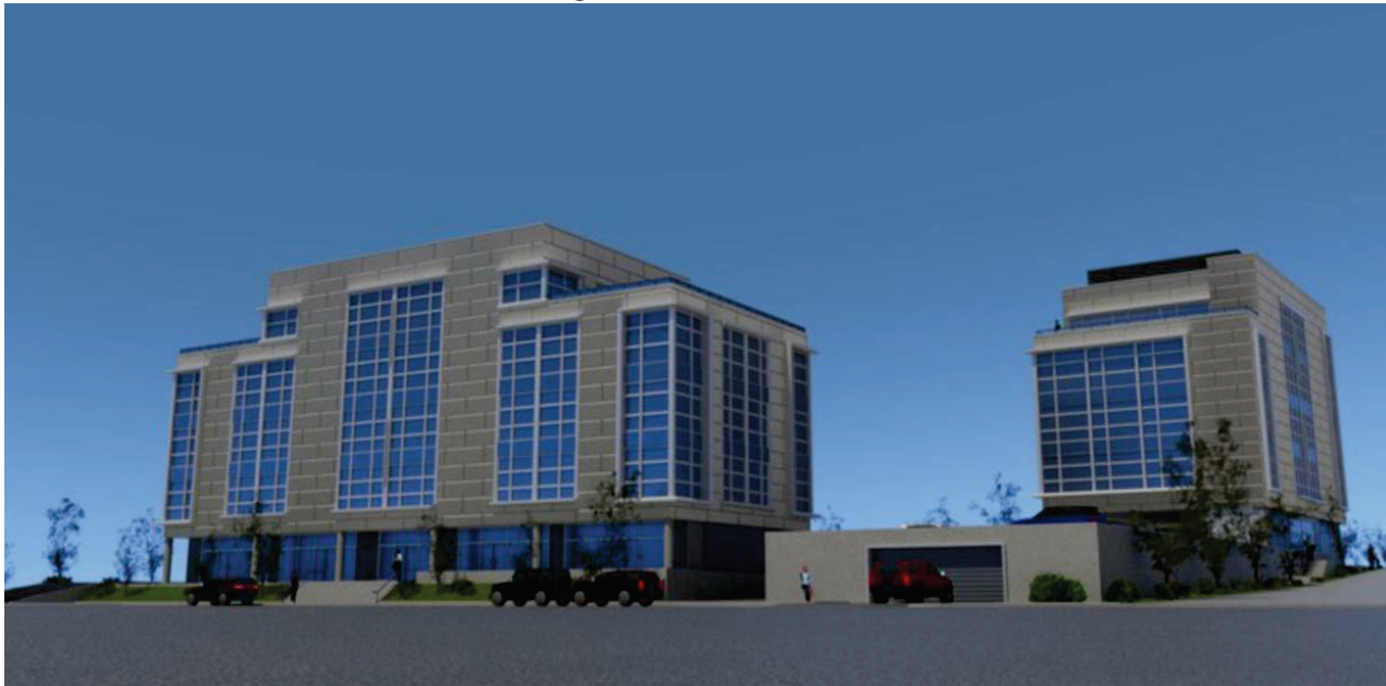
2 VIEW FROM SOUTH-EAST ALONG SEAFIELD CRESCENT