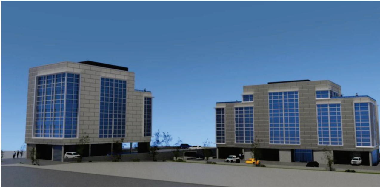
1 VIEW FROM NORTH-WEST ALONG DUFFERIN CRESCENT