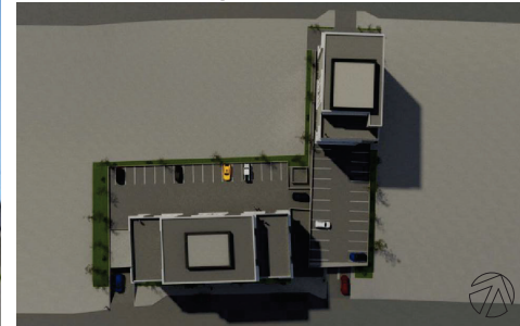
MARCH AT 3PM