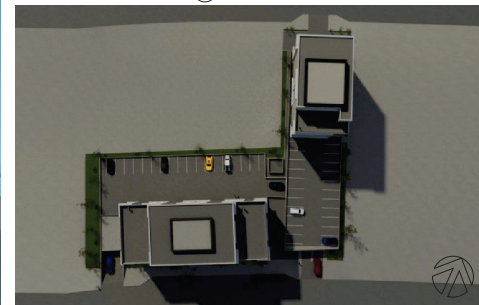
SEPTEMBER AT 3PM